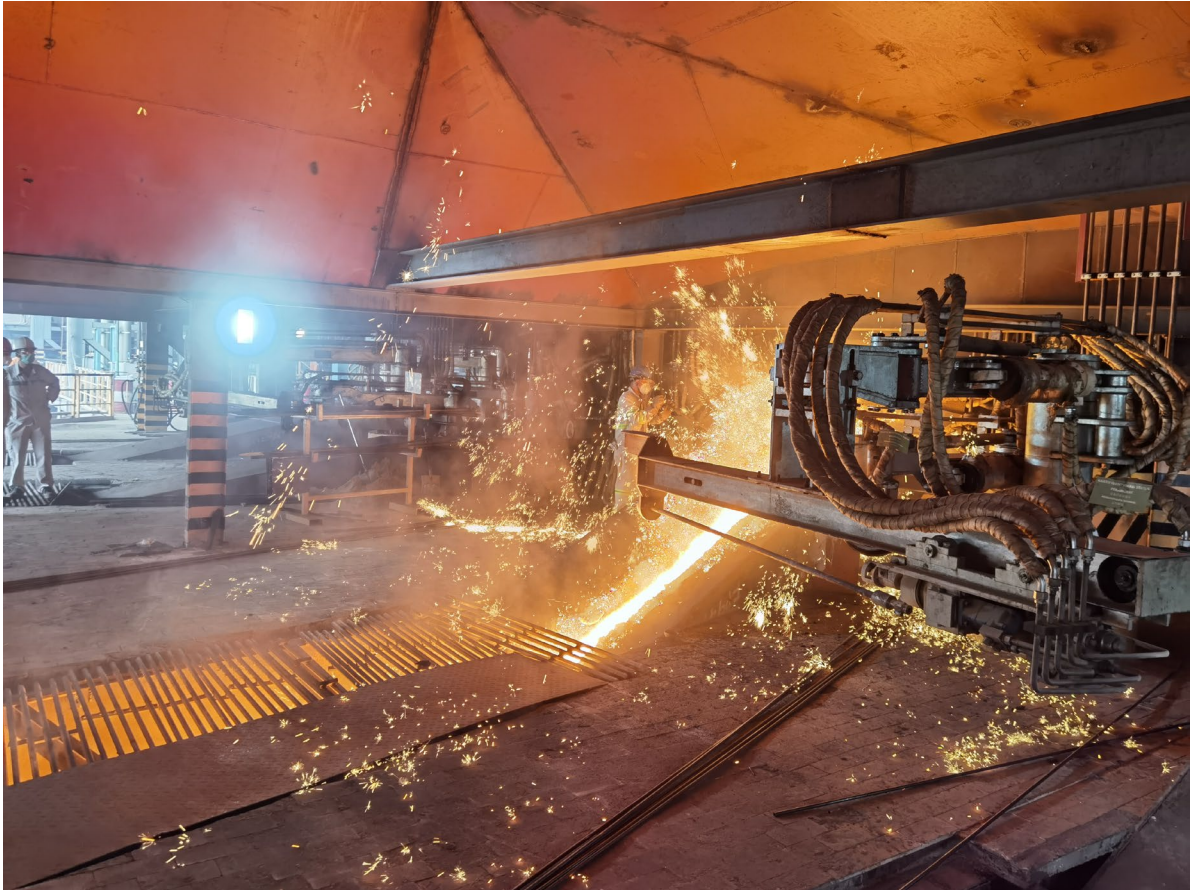
First NPI flowing at Oracle Nickel

As with ANI, ONI will require the issuance of an Industrial Business Licence (Izin Usaha Industri) ('IUI') to commence commercial sales of NPI. All NPI produced ahead of the IUI issuance will be stockpiled. It is presently expected that ONI's IUI will be in place to allow first commercial sales in early 2023.