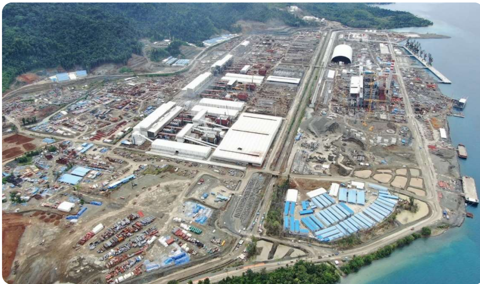
Aerial photo of the IWIP.

Completion of the acquisition of 80% of the Angel Nickel RKEF project, located within the Indonesia Weda Bay Industrial Park ('IWIP') will more than double Nickel Mines' attributable nickel metal production based on nameplate capacities of its RKEF projects.