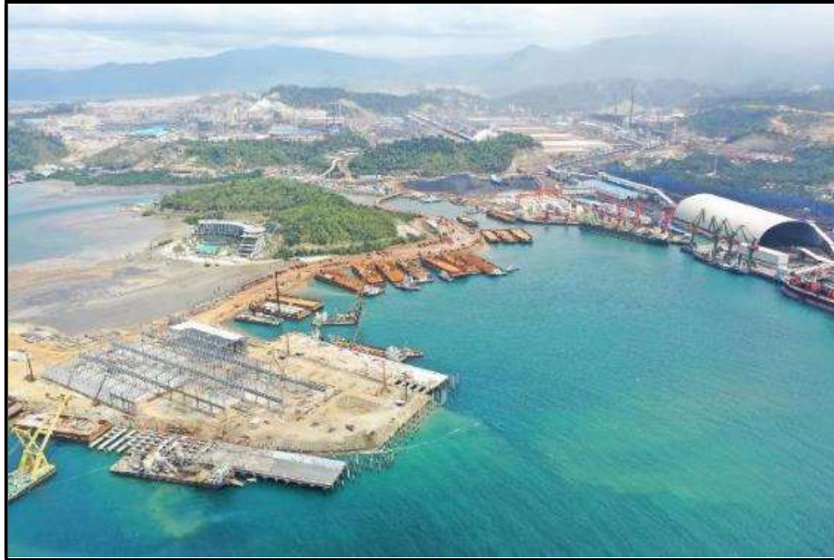
Aerial photo of the IMIP.

Nickel Mines owns an 80% interest in the Hengjaya Nickel and Ranger Nickel RKEF processing facilities within the Indonesia Morowali Industrial Park ('IMIP'), the world's largest vertically integrated stainless steel facility with a current stainless steel production capacity of 3.0 million tonnes per annum.