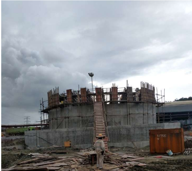
Base structure for Electric Furnace #1