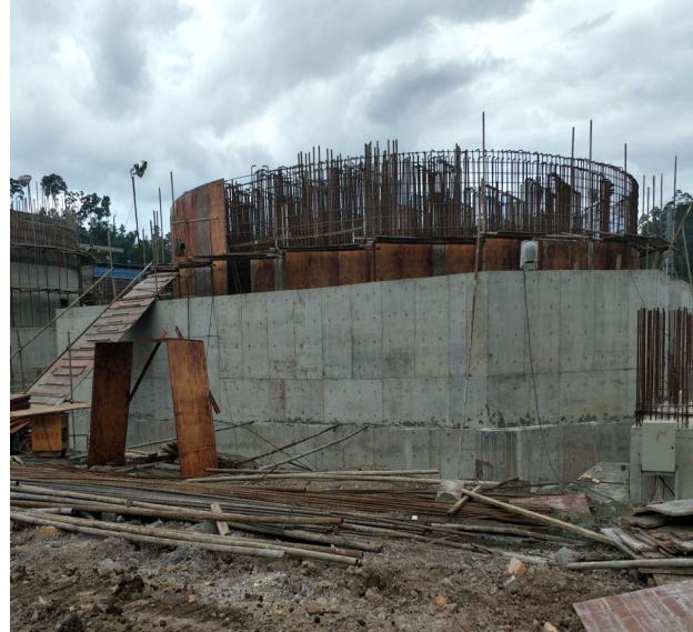
Base structure for Electric Furnace #2