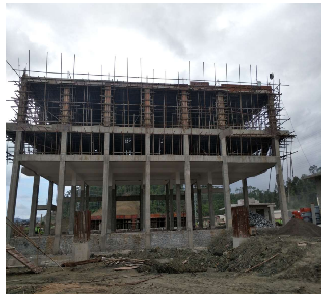
Electrical Switch Room

While Nickel Mines currently holds a 25% interest in the 2 RKEF lines, having now completed our IPO, the Company will shortly exercise its contractual option under the CSA to move to a 60% ownership interest.