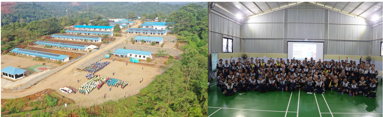
Hengjaya Mine camp

Project development remains ongoing, with an additional 4 tonnes of limonite bulk sample collected across the project area. The sample has been dispatched to the BRIN Mining Research Centre in Lampung, Indonesia, for metallurgical testing, including nickel leaching, acid consumption analysis, and further assessments on the recovery of scandium and other rare earth elements.