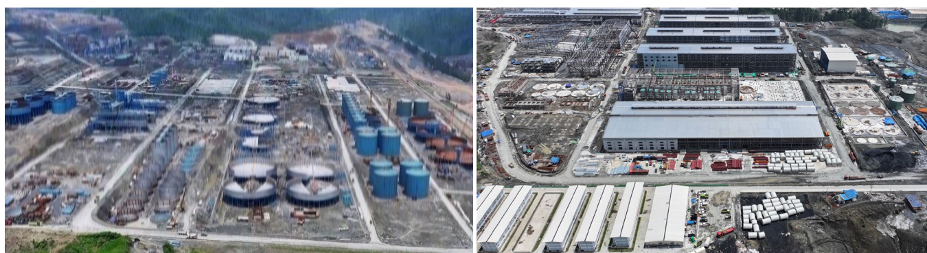
ENC HPAL (left) and sulfate and cathode refinery (right) construction progress

Subsequent to the end of the quarter, the Company has reached an agreement with its largest shareholder, Shanghai Decent, to defer the two remaining ENC acquisition payments of US$126.5m each by 6 months respectively to 1 January 2026 and 1 April 2026.